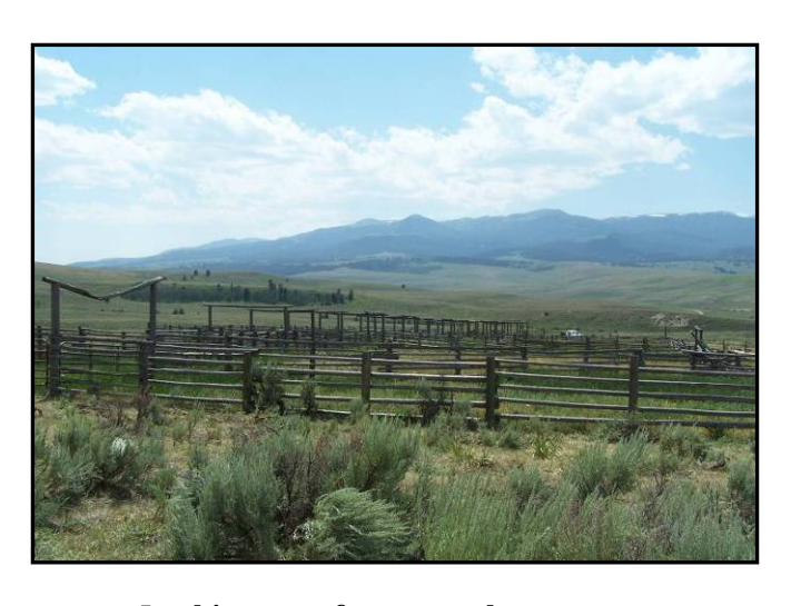
Looking west from corrals

New Corral location Ruby Centennial Road & West Fork in distance