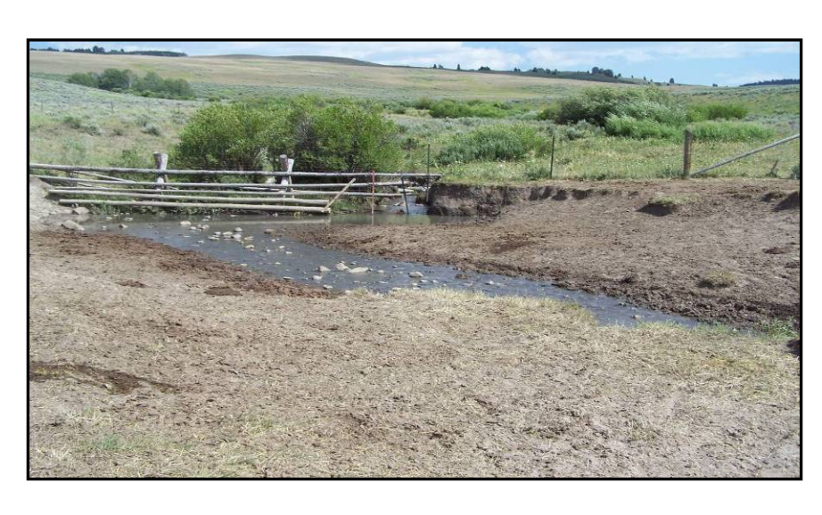
Existing Water Gap to be hardened & combined for crossing